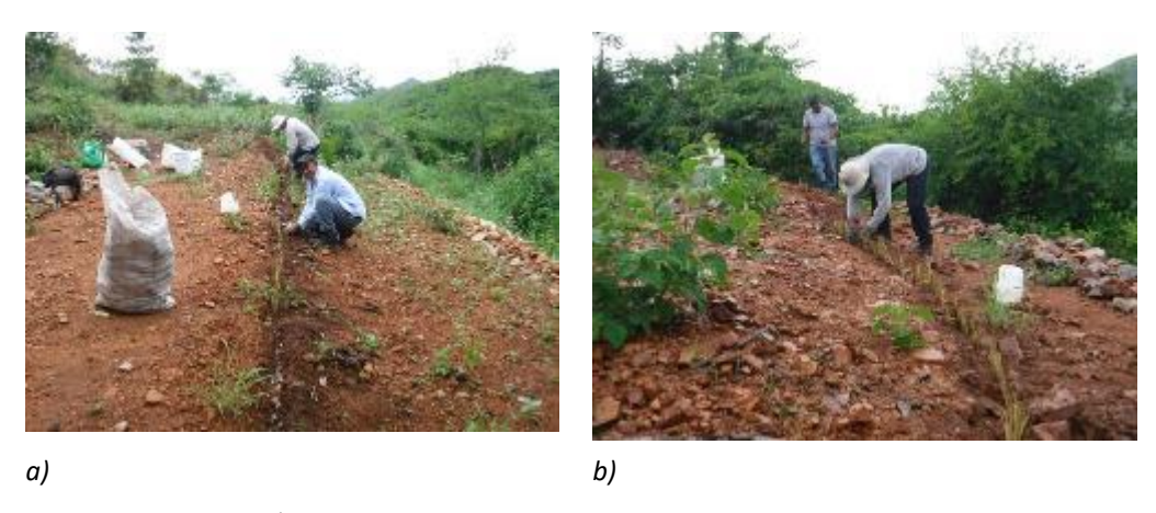
Photograph 3.3.2.a-b) Revegetation in Espinito-Mendoza concession.

From April to June, as part of the rehabilitation and remediation measurements, re-vegetation was carried out in areas affected by the previous drilling campaign.