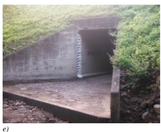
Photograph 2.2.1a. (a-d). (a) Staff gauge in San Lucas V-notch weir (LIWR001) (b) La Simona Trapezoidal weir (LIWR002), (c) La India Rectangular weir (LIWR004) were the staff gauge have been removed, (d) Alcantarilla and (e) Alcantarilla TSF. Taken 30<sup>th</sup> June 2018.